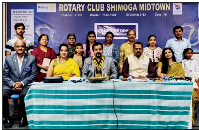
Rs. 26,000 Scholarship to 13 children of blood bank