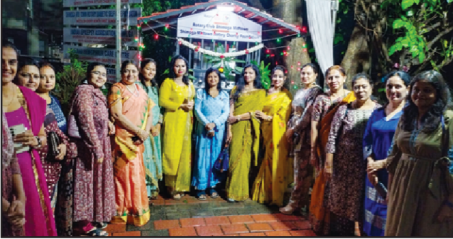
Inauguration of Public Drinking Water dispenser given by Rotary Club Shimoga Midtown in association with Rotary Charity Foundation It is located outside Rotary Blood Bank, Vinayakanagara for passers by who go to railway station, construction workers and general.