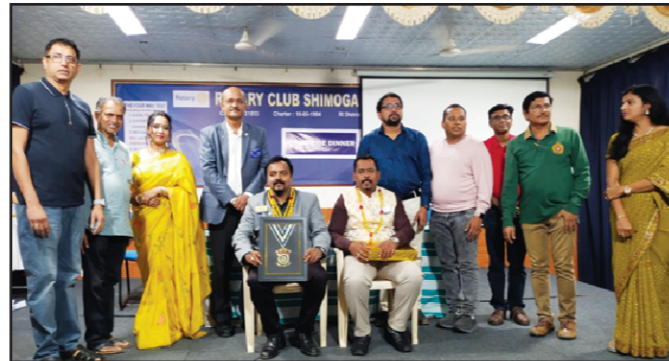
Gratitude dinner & honoured outgoing President & Secretary by the board